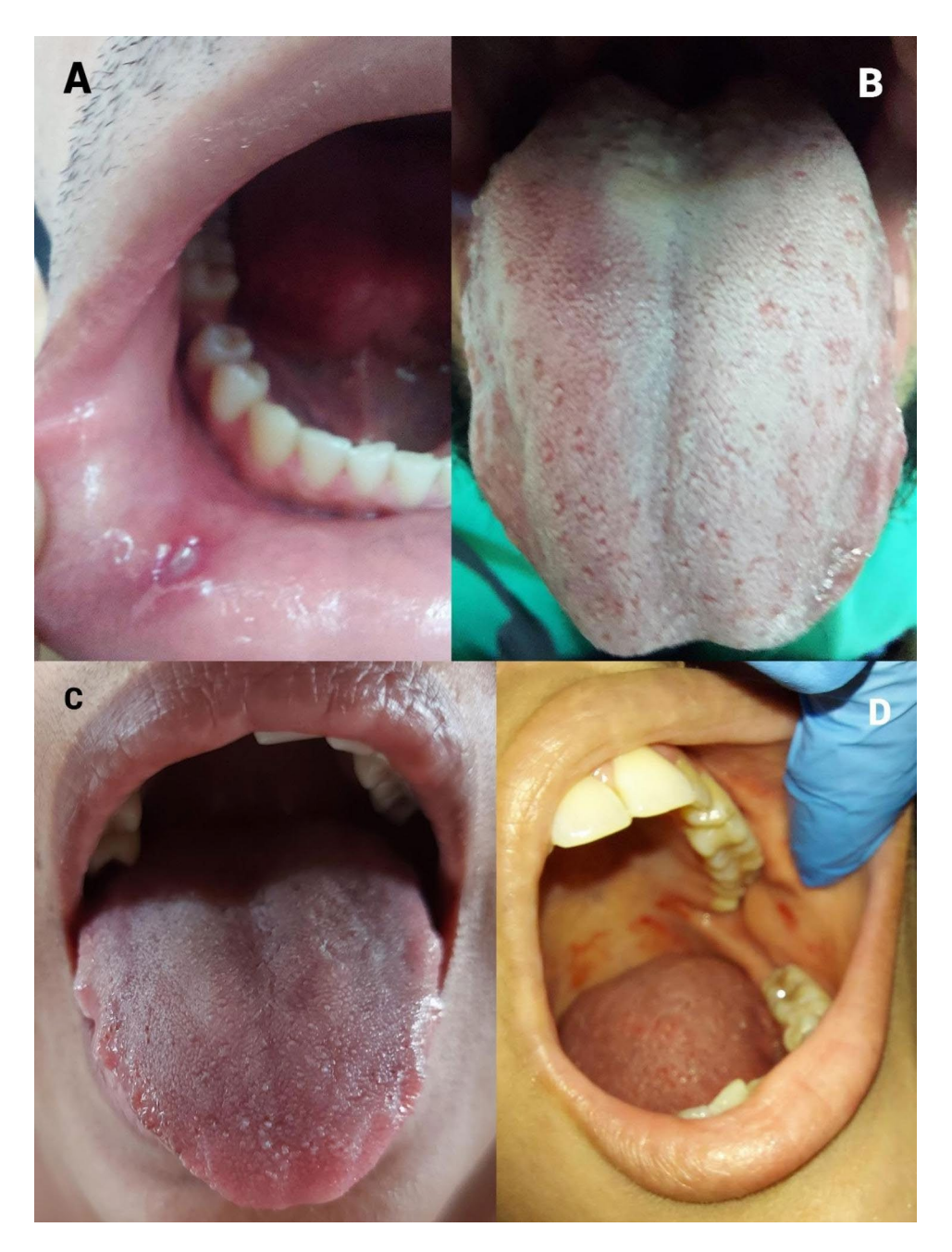
Fig. 2 Clinical presentations and diagnoses. (A) A male participant presented with a painful lesion on the inside of the bottom lip, exhibiting a clinical appearance of a white bump surrounded by a red, inflamed border. The center of the lesion appeared grayish-white. Clinical diagnosis: Mouth ulcer. (B) A male participant had a tongue surface coated with a thick whitish film and a fuzzy texture. Clinical diagnosis: Tongue coating. (C) A female participant presented a tongue with deep grooves on the surface running perpendicular to its length. Clinical diagnosis: Glossitis with indentations. (D) A female participant exhibited small pinpoint reddish-purple spots on the soft palate and buccal mucosa. Clinical diagnosis: Oral petechial lesions. Note: The clinical descriptions and diagnoses mentioned above were based on careful examination and evaluation by a qualified dentist

could be more frequent in the early prodromal phase of the disease.