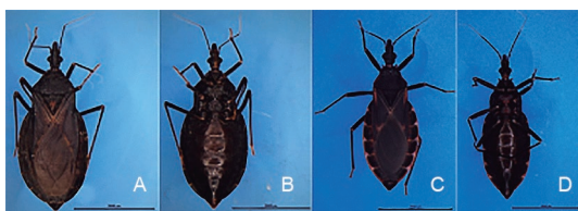
Fig. 2: the novel species of Triatoma sp. captured in Dali, Yunnan province (A back B ventral), T. rubrofasciata captured in Shunde, Guangdong province (C back D ventral).

kled, the top of it was slightly upwarping, oblique uplift in the centre of both sides (Fig. 1A-B). The conserved 16S ribosomal RNA gene, the Cytochrome b gene and 28S ribosomal RNA showed 93.08%, 77.16% and 91.55% similarities to T. rubrofasciata in GenBank, respectively. The sequences obtained from 16S rRNA of the Dali species were submitted to GenBank under the accession number MN200191. The phylogenetic trees were constructed using the 16S rRNA gene of the Dali species and other triatomines in GenBank and were based on the neighbor-joining method by MEGA6.0 (Molecular Evolutionary Genetics Analysis Version 6.0). The result showed that the Dali species fits in the same clade of T. rubrofasciata (Fig. 3). Morphological and molecular data suggest that it could be a novel Triatominae species. T. rubrofasciata specimens were collected mostly (1035/1041) inside human houses (60.9%) and domestic animal shelters. Most of the specimens (780/1041) were captured between July and August.