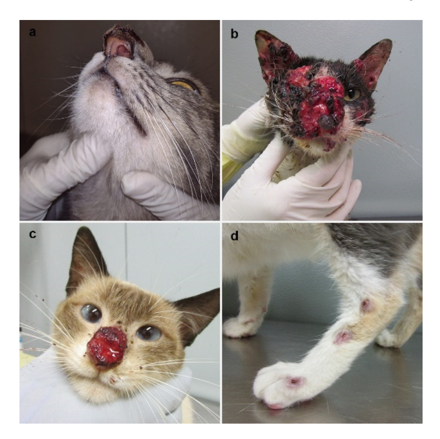
Figure 1. Clinical presentations of feline sporotrichosis caused by Sporothrix brasiliensis . ( a ) Swelling of the nasal bridge with crusted skin ulcer and nasal mucosa lesion causing narrowing of the left nostril. ( b ) Multiple skin lesions partially covered by hematic crusts draining serosanguinous exudate on the cephalic region with the involvement of nasal/ocular mucosa. ( c ) Crusted skin ulcer on the nasal bridge and nasal planum, draining serosanguinous exudate. ( d ) Ascending nodular lymphangitis on the left hindlimb.

In the present study, 119 isolates of Sporothrix sp. of cats with sporotrichosis presented cutaneous lesions associated or not with mucosal involvement (Figures 1 and 2).