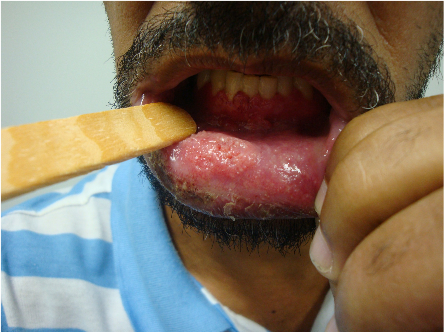
Fig 4. Ulcero-vegetative lesion on the lower lip due to hematogenous dissemination of Paracoccidioides sp. in a patient living with HIV/AIDS. Patient from group B, 45 years old, with recurrent oral lesion after two years of an irregular treatment.

https://doi.org/10.1371/journal.pntd.0010529.g004