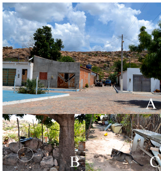
Fig. 2. Characteristics of households and proximity to a wild environment. (A) Rocky-outcrops surrounding the dwellings and considered major ecotopes of T. sherlocki . (B) Peridomicile with rock formations serving as a shelter for a dog and triatomines. (C) Dog in the peridomicile, with accumulation of diverse materials in the background, serving as a hiding place for triatomines.

f captured in the backyard where a T. cruzi seronegative dog was sleeping; g captured in the backyard where a T. cruzi seropositive dog was sleeping.