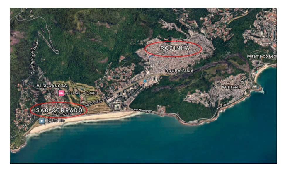
Figure 2. Aerial view of part of the South Zone of Rio de Janeiro. The red ellipses highlight São Conrado and Rocinha. Despite the proximity, Rocinha has twice the CFR of São Conrado (6.27% and 3.12%, respectively). However, its CFR is still lower than the average of the other favelas in Rio de Janeiro (9.08%).

On the other hand, although the average CFR presented by the favelas was significantly higher than that shown by the neighborhoods, some favelas gave CFR close to or lower than some neighborhoods. This is the case of Rocinha (6.27%), which had a lower CFR than Laranjeiras (6.42%) and Ipanema (7.06%). A possible explanation for this result would be the proximity of Rocinha to some high SDI neighborhoods, such as São Conrado (Figure 2), both located in the South Zone of RJ. Thus, the availability of medical assistance coverage for the residents of this favela would not be as pronounced as for other favelas, such as Acari (17.39%) and Pedreira (13.20%), both in the North Zone, and Fazenda Coqueiro (13.48%), in the West Zone. On the other hand, the elevated CFR presented by Ipanema, compared to the average of neighborhoods and favelas, can be explained due to the age composition of this neighborhood, where about 28% of the residents are over 60 years old, higher than the average of South Zone (21%), which showed the highest value among the regions of the city [14].