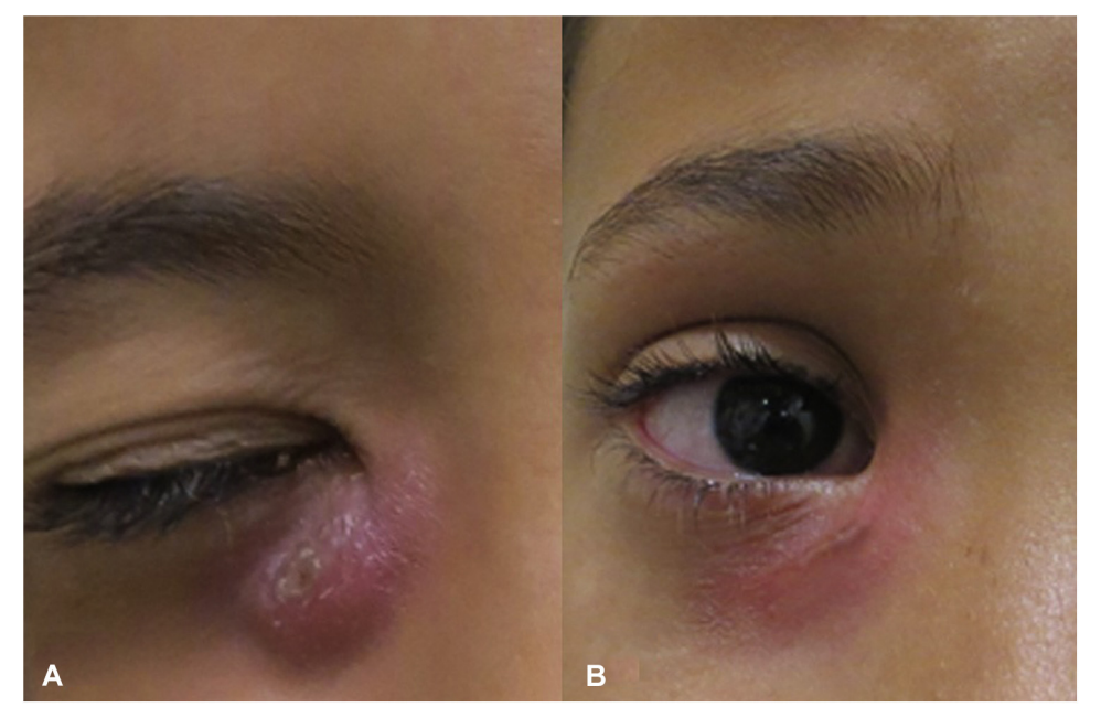
Fig 2. Case 2: A 7-year-old girl with dacryocystitis with a fistula on the inferior right eyelid. A, Acute phase with edema, erythema, and crust. B, Chronic phase, with scar and epiphora.

purulent exudate. No subcutaneous nodules were palpated (Fig 3). An incisional biopsy was performed, and Sporothrix species was isolated in culture. Histopathologic examination revealed dense granulomatous lymphomononuclear infiltrates (suppurative granuloma).