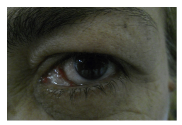
Fig 3. Case 3: A 47-year-old woman with "primary conjunctival sporotrichosis." Clinical presentation at admission: membranous yellowish lesion, with a smooth and shiny surface involving the plica semilunaris and caruncle of the left eye, associated with conjunctival hyperemia and purulent exudate.

lacrimal system, conjunctiva, eyelids, and eyebrows. To date, reports of sporotrichosis in the ocular adnexa are limited, and no comparative studies have been published related to the abovementioned structures.4