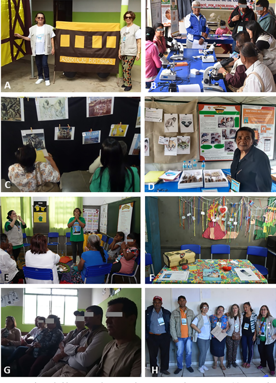
Fig 3. Images from each of the six wagons showing some thematic activities and strategic meetings : (A) wagon 1 with two members of Chagas disease from Rio Chagas Association that follow healthcare in Fiocruz (Rio de Janeiro); (B) wagon 2 with public observing parasites and insects under optical equipment; (C) wagon 3: re-readings of Portinari's artworks; (D) wagon 4: Biodiversit 'Art activities showing animal reservoirs; (E) wagon 5: self-massage workshop with adults and children; (F) wagon 6: craft drapery pending the most important perceptions written or spoken by the participants; (G) mini-courses for health professionals to present the new clinical protocol and therapeutic guidelines for Chagas disease (PCDT-Chagas); (H) compromising participants to organize new associations of CD affected persons, in this case at the city of Grão Mogol during the activities of wagon 1 of Chagas Express XXI in July 2019.

https://doi.org/10.1371/journal.pntd.0009534.g003