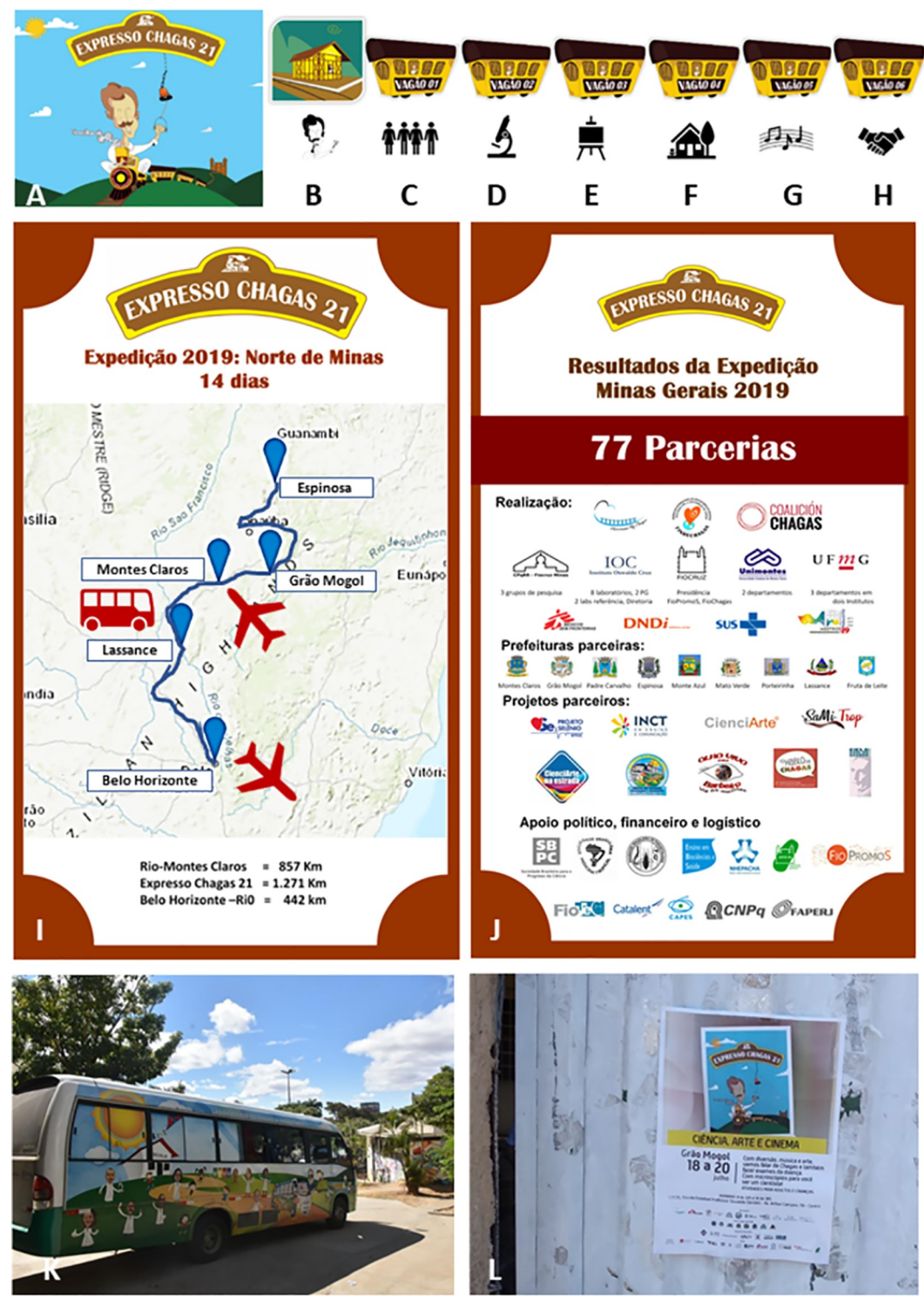
Fig 1. Materials and images of the Chagas Express XXI expedition to the northeast of Minas Gerais, Brazil, in winter vacation, July 2019. Art concept of Chagas Express XXI created by Erik J. Costa (A—J). The main pamphlet (A), the entry station (B) the successive wagons (C,D,E,F,G,H) and the general template of the banners (I,J) prepared as part of the exhibition composing expedition; the travel route and vehicles (prepared over a map that was in public domain - https://store.usgs.gov/map-locator) (I) and partnership logos of the projects network, cooperating institutions and municipalities in the presentation of activities (J); mobile laboratory in the "Science on the Road" project bus that merged the team (K); local poster to publicize scheduled activities (L).

https://doi.org/10.1371/journal.pntd.0009534.g001