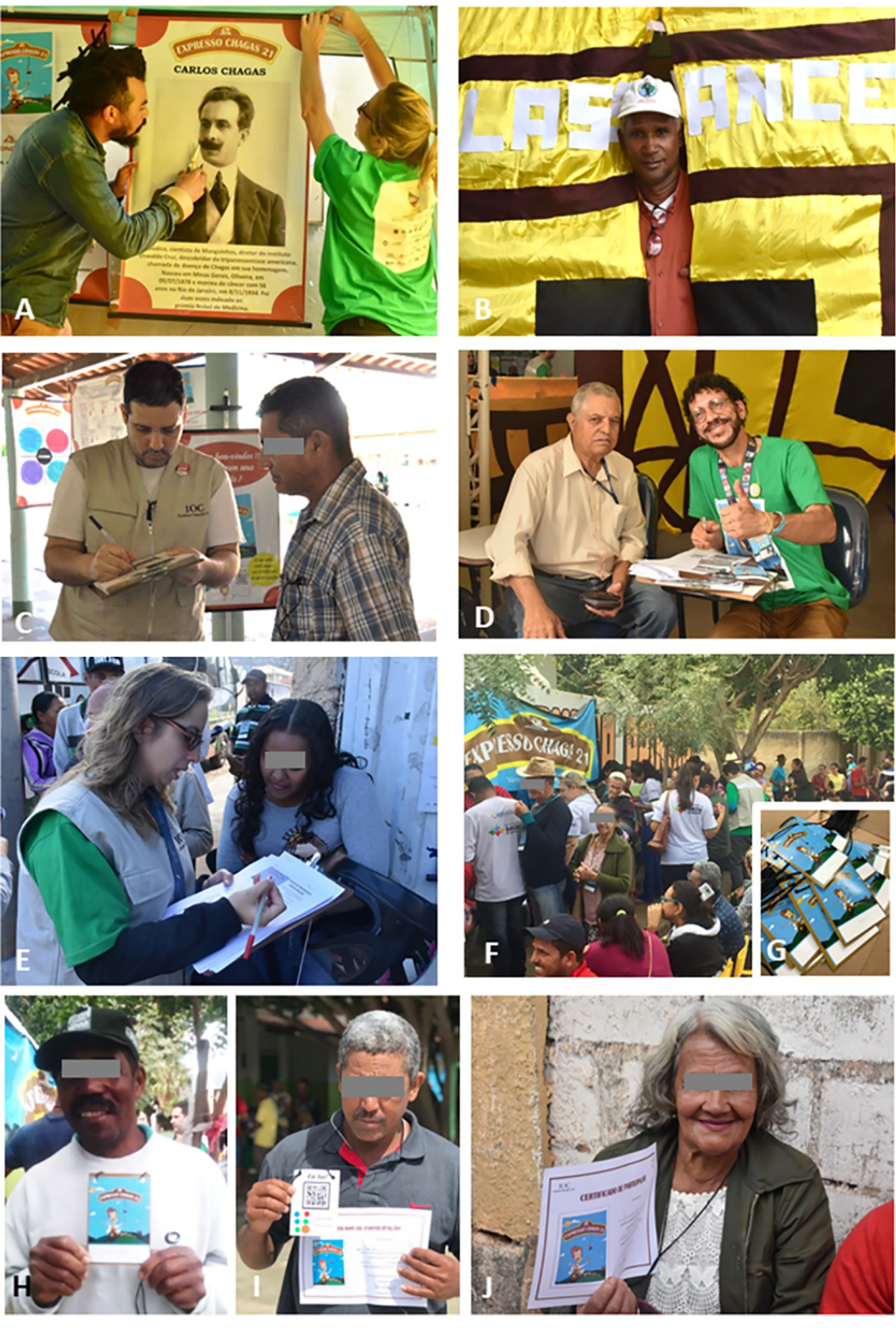
Fig 2. Images of the Station entry and exit points: (A) Setting up the exhibition and presenting Carlos Chagas, the scientist who discovered the disease in 1909; (B) Scenography of the exhibition entry named station "Lassance", alluding to the village where the discovery took place; (C,D,E) Filling forms for each visitant; (F) crowded waiting line to attend the activities in a local school at Espinosa city, Minas Gerais; (G) a set of badges (identification cards) for the visiting public. Note the green T-shirt that identified the field team of the project (A,D,E) and the field jacket (C) that is used in field institutional missions (C, D); (H,J) proud visitants showing their front (H) and back (I) views of their badge and certificate (J) smiling to express joy and happiness.

https://doi.org/10.1371/journal.pntd.0009534.g002