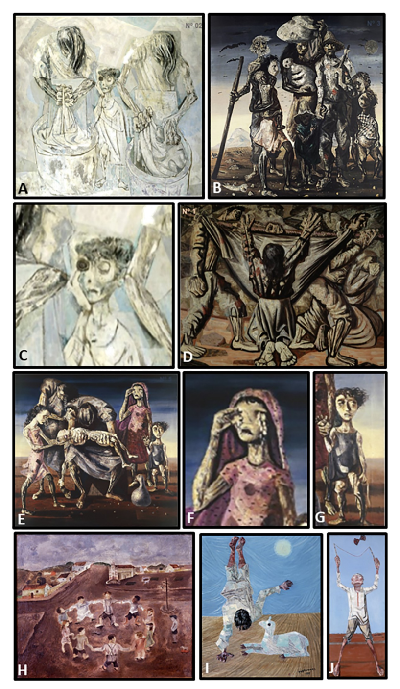
Fig 4. Images of some paintings of Candido Portinari presented to the participants in wagon 3: (A) " Washerwomen ", painted in 1944, size 170 x 200 cm; (B) " Retreatants ", painted in 1944, size 190 x 180 cm; (C) " Washerwomen "- detail of the central character with Romaña's sign in the left eye; (D) " Burial in the hammock ", painted in 1944, size 180 x 220 cm; (E) " Dead Child ", painted in 1944, size 180 x 190 cm; (F) " Dead Child "-detail of woman with falling tears; (G) " Dead Child "-detail of a child character with Romaña's sign in the right eye; (H) " Children circle ", painted in 1932, size 39 x 47 cm; (I) " Upside down ", painted in 1956, size 55 x 46 cm; (J) " Diabolo " (a game in which a two-headed top is thrown up and caught with a string stretched between two sticks), painted in 1959, size 154 X 75 cm. Their technical characteristics and museum locations are found in <u>www.portinari.org.br</u>.

https://doi.org/10.1371/journal.pntd.0009534.g004