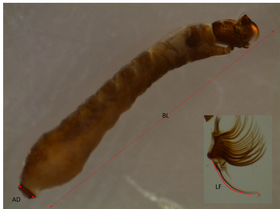
Figure 1. Measurements of black fly larvae morphology taken using CMEIAS: Anal disk diameter (AD), Body length (BL), and Labral Fan Length (LF).

A total of 430 S. nigrimanum larvae were collected, from which 15 were last instar larvae. Three of these 15 specimens were dissected in order to confirm species identity and the remaining larvae were measured (Table 1). All variables were significantly correlated (Table 2). Linear regressions indicated that water velocity correlated positively with anal disk diameter ( p < 0.01 , r^2 = 0.73 ) and body length ( p < 0.05 , r^2 = 0.42 ) and negatively with labral fan length ( p < 0.01 , r^2 = 0.69 ) (Fig. 2).