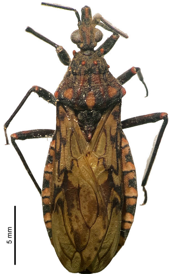
Figure 4. Panstrongylus rufotuberculatus (Champion, 1899), male, dorsal view.

Identification. The genus Panstrongylus Berg, 1879 was identified by the position of the antennae, which are inserted close to the eyes. The species was identified by the golden bristles on the dorsal surface of the body;