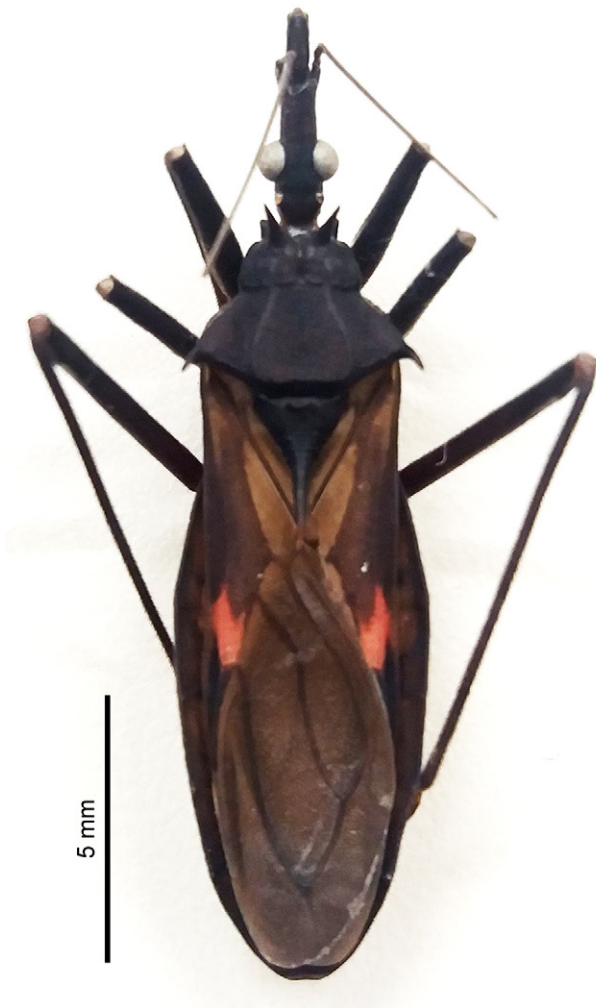
Figure 3. Eratyrus mucronatus Stål, 1859, male, dorsal view.

New records. BRAZIL – Amazonas • Barcelos, riverside community of Piloto; 00°53.60'S, 062°59.23'W; elev. 43 m; 15.XI.2017; collected by community residents