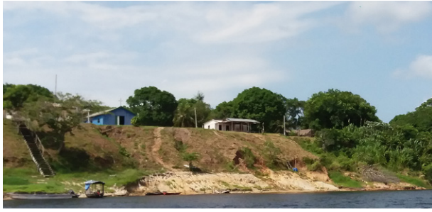
Figure 2. The riverside community of Piloto, Barcelos, Amazonas, Brazil.

em Diptera e Hemiptera, at Fiocruz using the dichotomous keys by Lent and Wygodzinsky (1979) and Galvão (2014). The triatomines were deposited in the Triatominae Collection at the Oswaldo Cruz Institute (CTIOC).