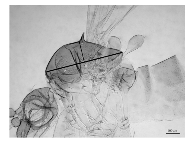
Figure 2. Morphological anomaly in the scutum of Lutzomyia diabolica (male) from Nicaragua. A: length of thorax; B: midpoint on the thorax; C: distance between the midpoint of the base of the spine and the midpoint of the thorax.

different in the two species, only this character in the thorax is not the only one to distinguish them, since both species have other characteristics belonging to their respective genera. In this male specimen, unlike in our female Bi. olmeca bicolor female, the spine was longer (60.4 \mu m) and measured 35.1 \mu m in the middle region of the scutum, with the convexity directed towards the posterior region of the thorax (towards the scutellum) (Table 1; Figure 2).