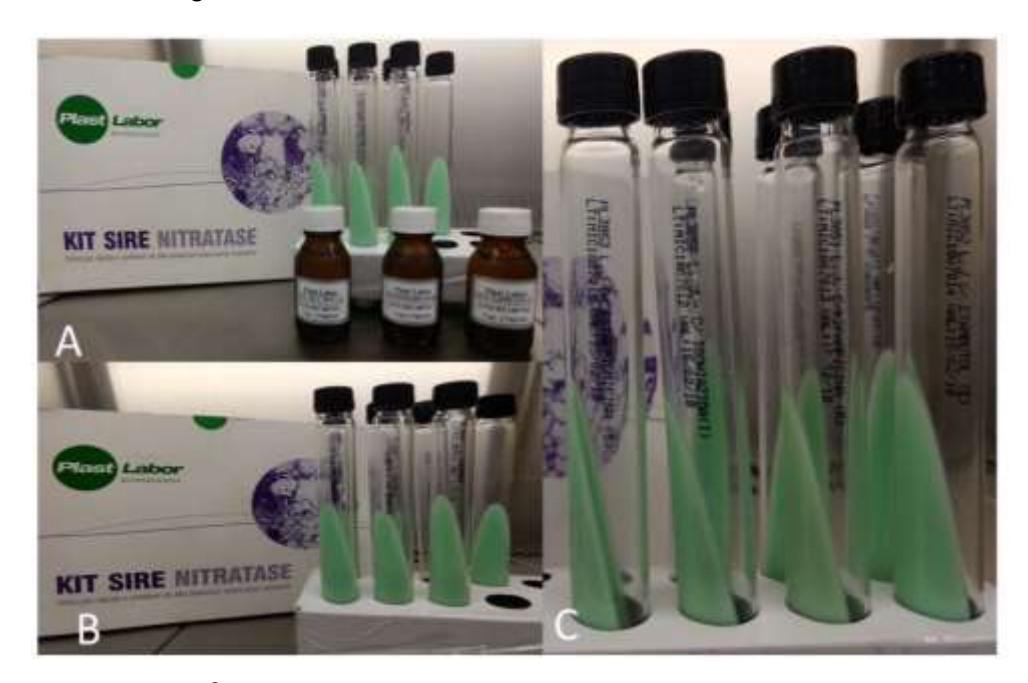
Figure 1. The Kit SIRE Nitratase® components

If a color change (varying from pink to dark red) was observed, it implied that nitrates had been reduced to nitrites, and that the test was positive. Thus, all the remaining tubes containing isolates were identified using the reagent mixture. If no color appeared in the growth control tube at day seven, the remaining tubes were re-incubated, and the identification test repeated at day 10 and 14. An isolate was considered resistant to the antibiotic at its critical concentration if the color change in the tube containing the drug was dark red, and was similar to the color observed in the 1:10 inoculum growth control tube [8,9]. All the Kit SIRE Nitratase® components are shown in Figure 1.