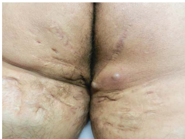
FIGURE 3: Recurrence in the right buttock. Presence of scars on the buttocks and thighs after surgeries for grains excision