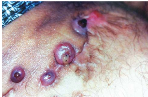
FIGURE 1: Eumycetoma. Nodules and fistulas, with exudation and elimination of the grain in the anterior thigh

Eighth year of follow-up, a new asymptomatic, well delimited skin-colored nodule, of approximately 2 cm in size, without a fistula was observed in the right infragluteal region (Figure 3). After excisional biopsy of the lesion, with observation of black grains and Madurella mycetomatis growth in culture, the diagnosis of eumycetoma was confirmed (Figure 4). After new image tests showed no remaining lesions, the patient was kept under follow-up, without antifungal chemotherapy.