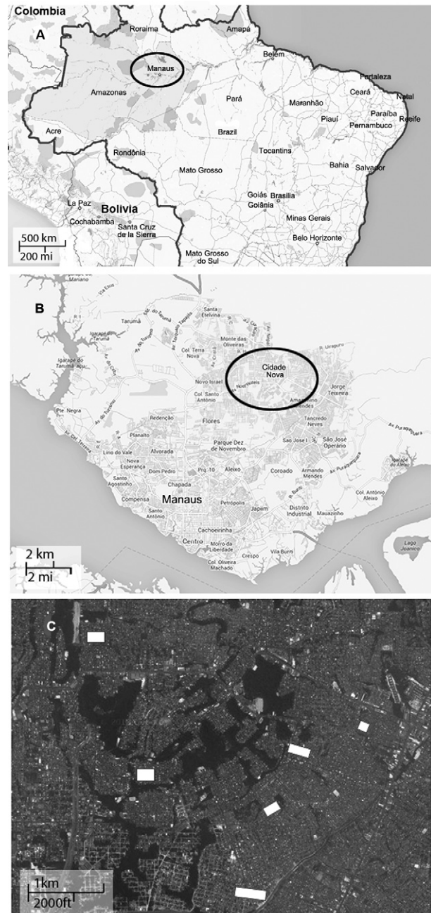
Fig. 1: maps of the study area. A: Brazil with the localisation of Manaus, state of Amazonas, indicated by a black circle; B: the neighbourhood of Cidade Nova, in Manaus, indicated by a black circle; C: localisation of the six clusters, indicated by white rectangles.

The climate in Manaus is a tropical monsoon climate with an annual daily average temperature of 27°C, an average annual rainfall of approximately 2,300 mm and