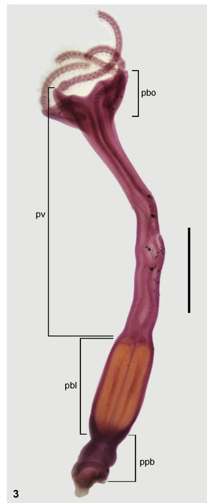
Figure 3. Pterobotrium crassicole from Mugil liza . Entire plerocercus, pars bothrialis (pbo), pars vaginalis (pv), pars bulbosa (pbl) and pars postbulbosa (ppb). Scale bar = 1 mm.

Measurements are in millimeters, means in parentheses. L= length; W= width.