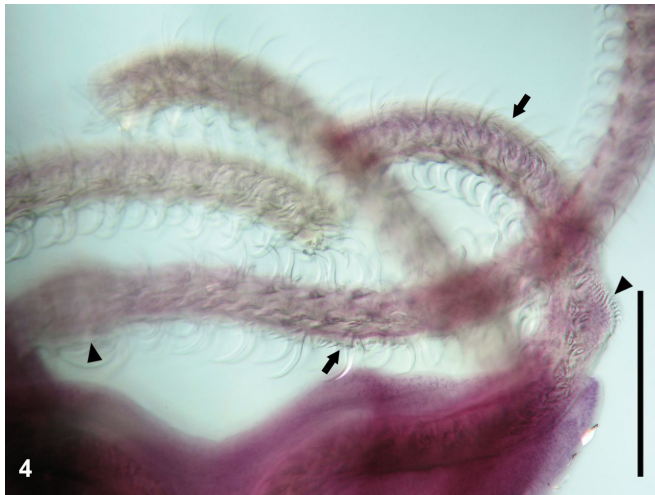
Figure 4. Pterobothrium crassicole plerocercus from Mugil liza . Detail of the tentacles, shown external surface intercalary microhooks to principal hooks (arrow), and swelling present on the distinctive basal armature tentacle (arrowhead). Scale bar = 250 \mu m.

pedicels in a cruciform arrangement. Pedunculus scolecis subcylindrical, narrower than pars bothrials. Principal rows of metabasal armature forming alternating half-spirals of five large heteromorphous, hollow hooks; small interpolated hooks between principal rows on bothrial and antibothrial surfaces. Distinctive basal armature and swelling present on internal and external tentacle surface, macrohooks present on internal surface; asymmetrical basal swelling of tentacle present. Hooks 1(1') widely separated, falciform in proximal region, becoming smaller, stout and uncinat distally. Hooks 2(2') falciform, decreasing in size in distal metabasal region, heel gradually enlarging, toe gradually disappears. Hooks 3(3') falciform with short base and heel, gradually decreasing in size distally. Hooks 4(4') and 5(5') of proximal 12 rows digitiform, hooks 4(4') become falciform at row 13, hooks 5(5') remain digitiform along the entire file, markedly reducing in length in the apical region, heel and toe absent, falcate with pointed tips. Intercalary rows present proximal to each principal row; intercalary rows extend onto external surface to merge with band of hooks occupying midline of external surface of tentacle. Tentacle sheaths sinuous. Bulbs elongate. Pars postbulbosa present.