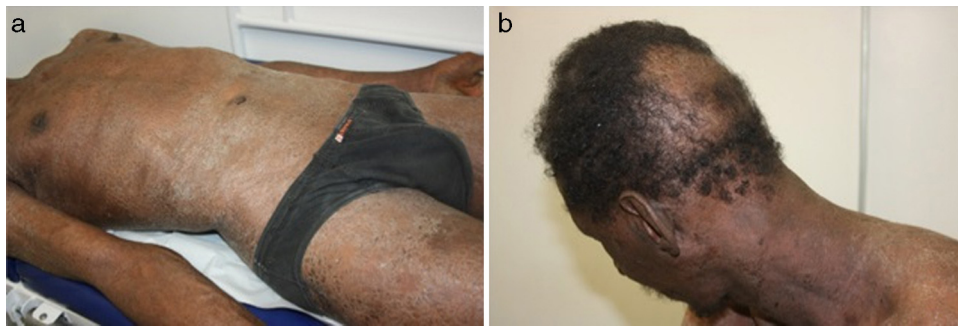
Fig. 1. (a) Exfoliative erythroderma. (b) Diffuse non-scarring and circumscribed alopecia.

Dermatophytoses are superficial cutaneous mycoses that affect keratinized tissues. 1 The dermatophyte fungi belong to the genera Trichophyton , Microsporum and Epidermophyton . Regarding their primary habitat, they are classified in zoophilic, geophilic and anthropophilic.