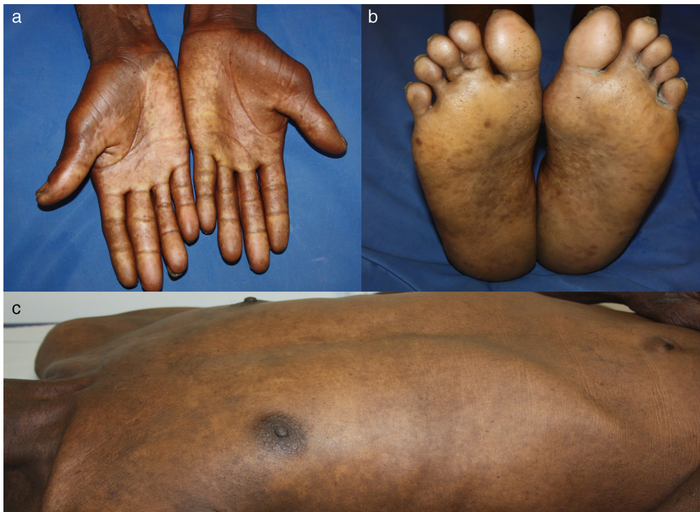
Fig. 4. (a, b) Complete regression of palmoplantar hyperkeratosis. (c) Complete regression of exfoliative erythroderma.

During the investigation, the CD4 + count was 177 cells/mm 3 and the viral load was 30,455 copies/ml, which configure an advanced immunosuppression. It is possible that the association of alcoholism/immunosuppression resulted in the severity of the clinical manifestations.