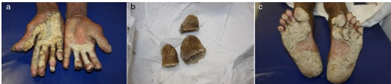
Fig. 2. (a) Palmar hyperkeratosis, nail dystrophy and corneal projections of up to 3 cm. (b) Plantar hyperkeratosis and nail dystrophy.

On the other hand, atypical forms of dermatophytosis have been linked to AIDS. 7 This report emphasizes the severity of clinical manifestations that led us to the diagnosis of AIDS.