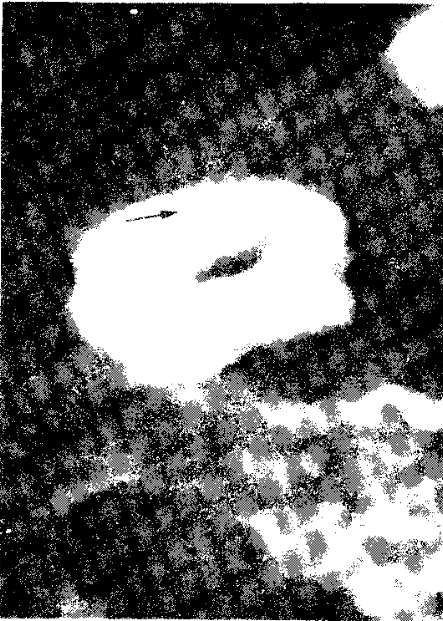
Fig. 2. positive immunofluorescence for spotted fever-group rickettsiae in blood vessel wall of brain tissue in patient with a disease that is clinically, epidemiologically, and anatomopathologically compatible with Rocky Mountain spotted fever (X 2000).

the disease incidence are needed to determine whether there is an association between this type of vegetation and the presence of A. cajennense , the predominant tick vector in Brazil.