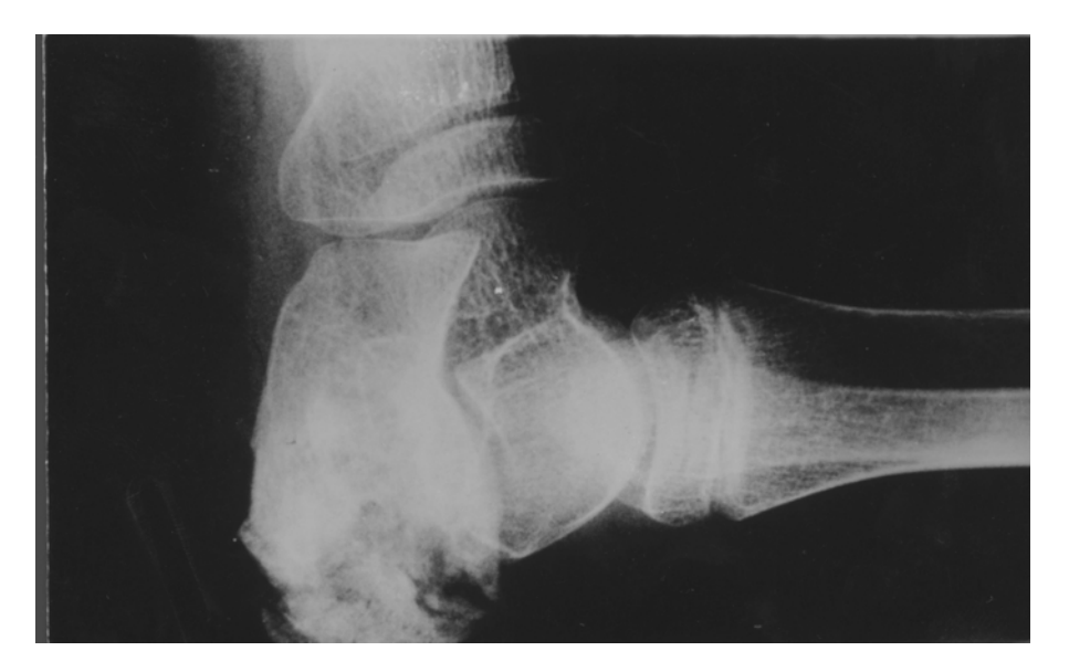
FIG. 1. Roentenogram of right calcaneous with osteolytic lesion.

With no improvement after 10 days, incision and drainage was performed. The aspirated material was tested by microscopic examination and culture for bacteria, all of which were negative. She continued with fever, and a haemogram revealed a leukocytosis and an increased sedimentation rate, at which time oxacillin was stopped and vancomycin added. At this time cutaneous lesions similar to molluscum contageosum, subcutaneous nodules, and hepato-