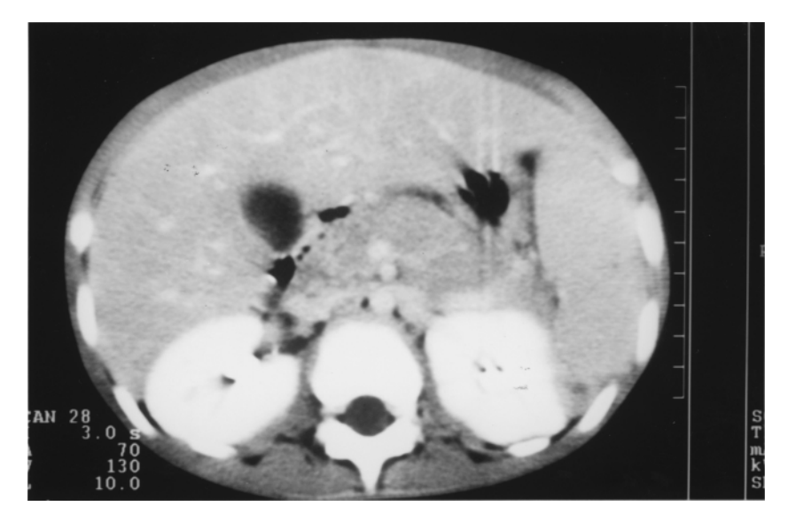
FIG. 2. CT scan of abdomen with enlargement of lymph nodes and hepatosplenomegaly.

Thoracic and abdominal CT scan demonstrated lymph nodes in the mediastinum and in the intraabdominal region, as well as hepatosplenomegaly,