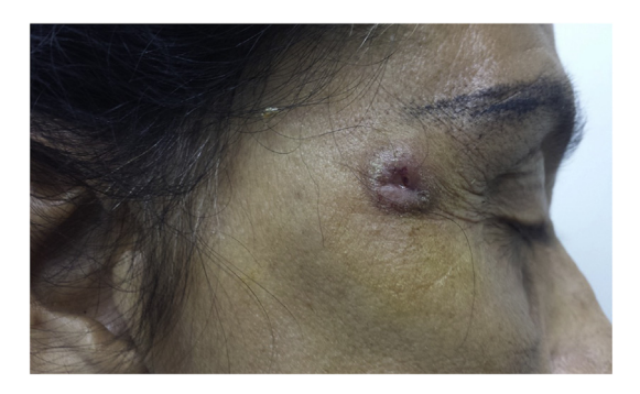
Fig. 2. Patient 1 - Nodule with central exulceration in the right temporal region.

patient was treated with itraconazole 200 mg/day over 9 months, achieving a clinical cure, but with fibrosis of the inferior tarsal and bulbar conjunctiva of the same eye (Fig. 3).