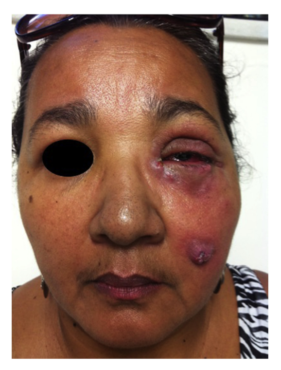
Fig. 4. Patient 2 - Conjunctival hyperemia associated with infiltration and periocular edema. Ulcerated nodules are noted in the ipsilateral malar region.

The swab culture of the conjunctival lesion was positive for Sporothrix sp. The patient was treated for 2 months with itraconazole 200 mg/day; however, it was necessary to increase the dose to 400 mg/day for an additional 6 months due to clinical worsening. As sequelae, she had fibrosis and symblepharon on the superior conjunctiva of the affected eye (Fig. 5).