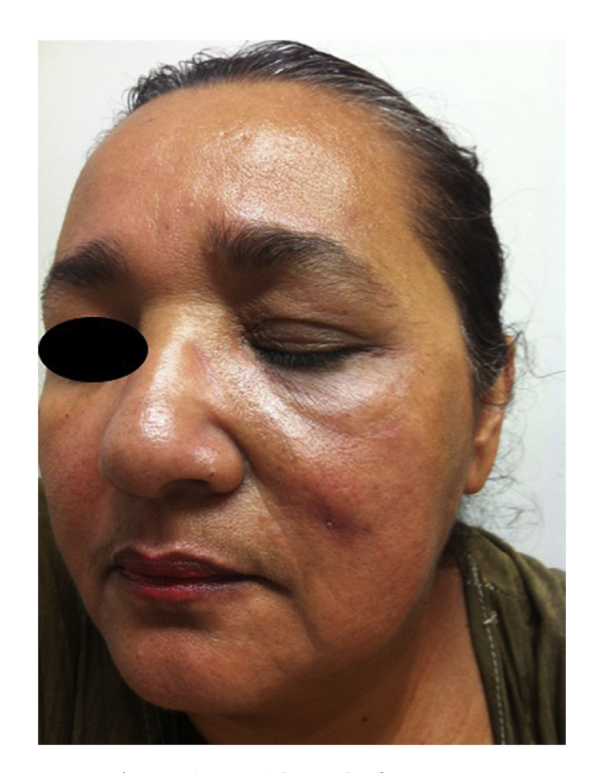
Fig. 5. Patient 2 - Eight months after treatment.

The swab culture of the conjunctival lesion was positive for Sporothrix sp. The patient was treated for 2 months with itraconazole 200 mg/day; however, it was necessary to increase the dose to 400 mg/day for an additional 6 months due to clinical worsening. As sequelae, she had fibrosis and symblepharon on the superior conjunctiva of the affected eye (Fig. 5).