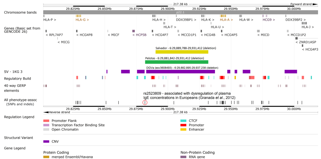
Figure 2. In silico functional study on the regulatory potential of the deletion at 6p22.1. Schematic representation of the locus containing the deletion region associated with asthma in Brazilian populations (expanded view: 6:29,801,381–30,018,756; RefSeq: GRCh38). This region was cross-referenced with DNA sequence annotations, including: location of protein coding or non-protein coding genes (GENCODE 26); presence of large structural variations identified by the 1000 genomes project, phase 3 (SV – 1KG 3); position of putative regulatory elements (regulatory build); location of constrained elements for 40 eutherian mammals (GERP, Genomic Evolutionary Rate Profiling); presence of SNPs and short indels associated with any human phenotype in previous studies. Limits of the deletions found in samples from Salvador or Pelotas are symbolized by a yellow or a green bar, respectively. Image created using the Ensembl genome browser ( http://www.ensembl.org ).

Next, we conducted a meta-analysis on Salvador and Pelotas samples, by applying a random-effects model that assumes significant inter-study variability (Table 3). This analysis confirmed association of this deletion with the disease ( OR = 2.3 ; p = 3 \times 10^{-6} ), providing support for the notion that structural variations could represent risk factors for asthma.