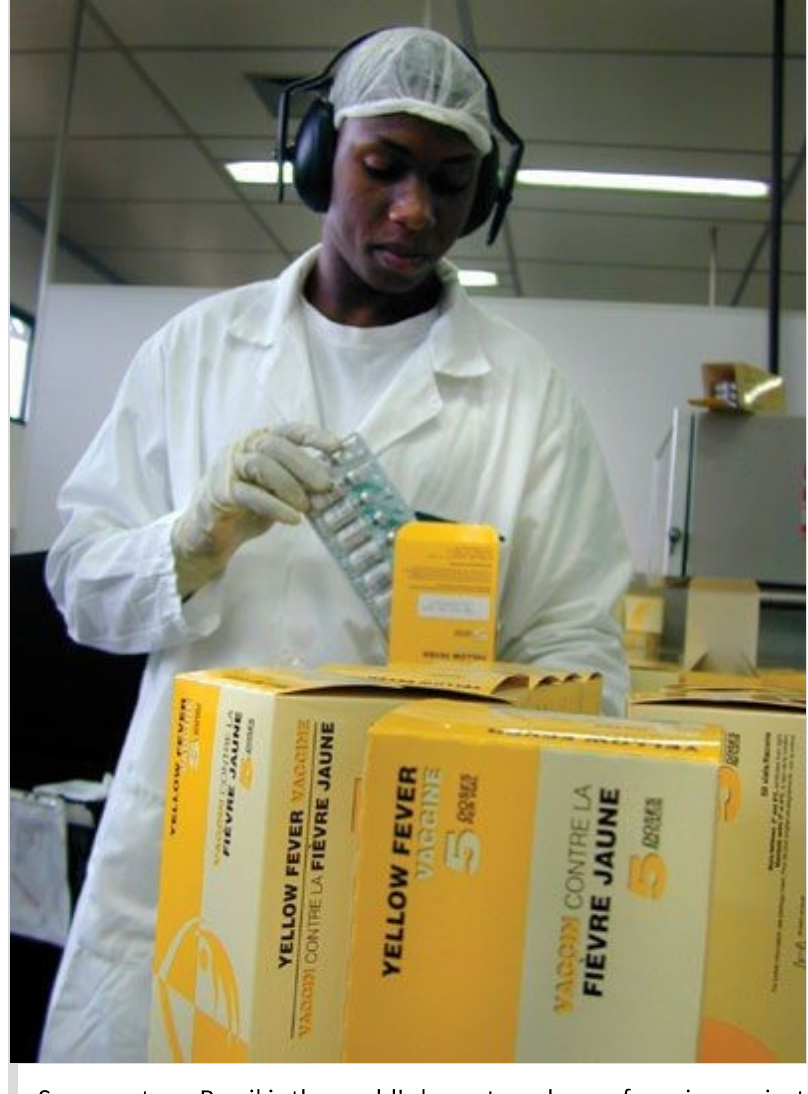
Success story: Brazil is the world's largest producer of vaccine against yellow fever.

Given all of these factors, it became clear that the way in which research, development and innovation were being carried out needed to change and that these activities had to be coordinated at the national level, within a robust industrial-policy framework.