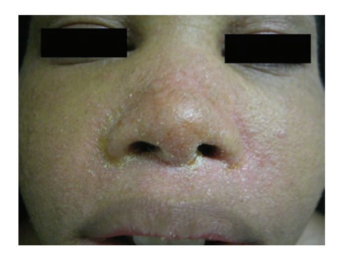
Figure 1. A nasal and perinasal erythematous scaly lesion with crusting of the anterior nares, a classic feature of infective dermatitis associated with human T cell lymphotropic virus type 1 infection.

levels of calcium and lactate dehydrogenase were within normal limits. Physical examination, chest radiography, and abdominal ultrasonography revealed no other sites affected by lymphoma. Monoclonal integration of HTLV-1 was detected in the skin tumor cells by long, inverse PCR (figu e 3) [8], and the presence of HTLV-1 proviral and genomic host DNA sequences was confi med by sequencing. This result confi med the diagnosis of ATL.