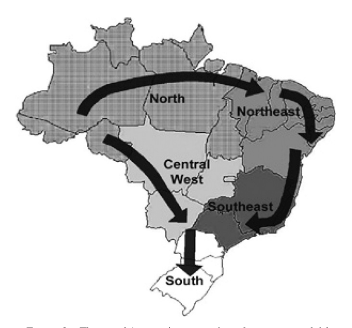
FIGURE 2. Theory of Amazonian expansion of tegumentary leishmaniasis by Leishmania (Viannia) braziliensis . Regions of Brazil are North, Central West, Northeast, Southeast, and South.

possible influence of the endemicity level in the form of the disease that is clinically manifested. The fact that there was a strong negative correlation (approximately –1) indicates the closeness of the points in relation to the linear equation of adjustment. The high R<sup>2</sup> value of –0.980 indicates that approximately 98% of EPR variance could be explained by adjusted prevalence level. Similarly, this finding was observed with MLP (R<sup>2</sup> = –0.938) and the MLP for persons \geq 40 years of age (R<sup>2</sup> = –0.960).