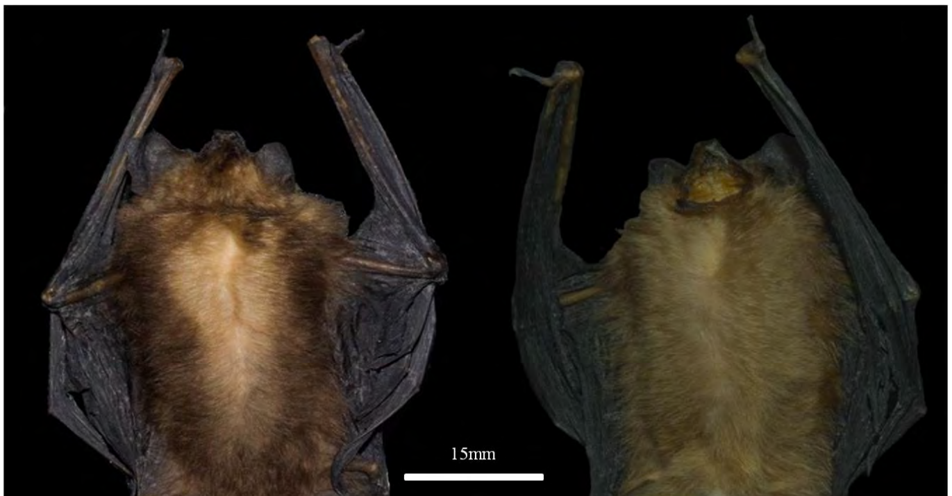
FIGURE 2. Dorsal and ventral views of the specimen of Rhogeessa hussoni (ALP 9656) from Refúgio da Vida Silvestre Mata do Junco, Sergipe, northeastern Brazil.