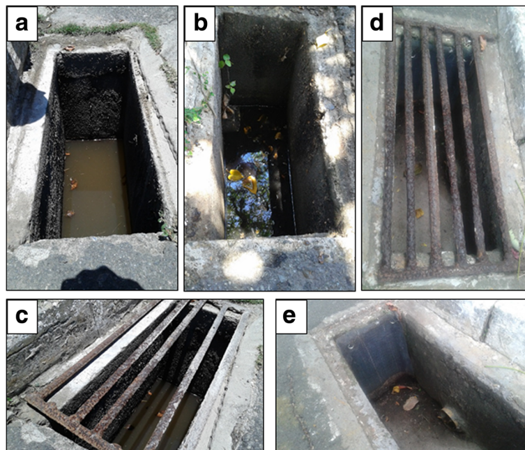
Fig. 2 Typical storm drains surveyed in Piatã neighborhood in the 2015 pre-intervention period (a, b, c) and in the 2016 post-intervention period (d, e), in Salvador, Brazil

a P-values for the comparison between pre- and post-intervention totals using MacNemar's test or Wilcoxon signed-rank test