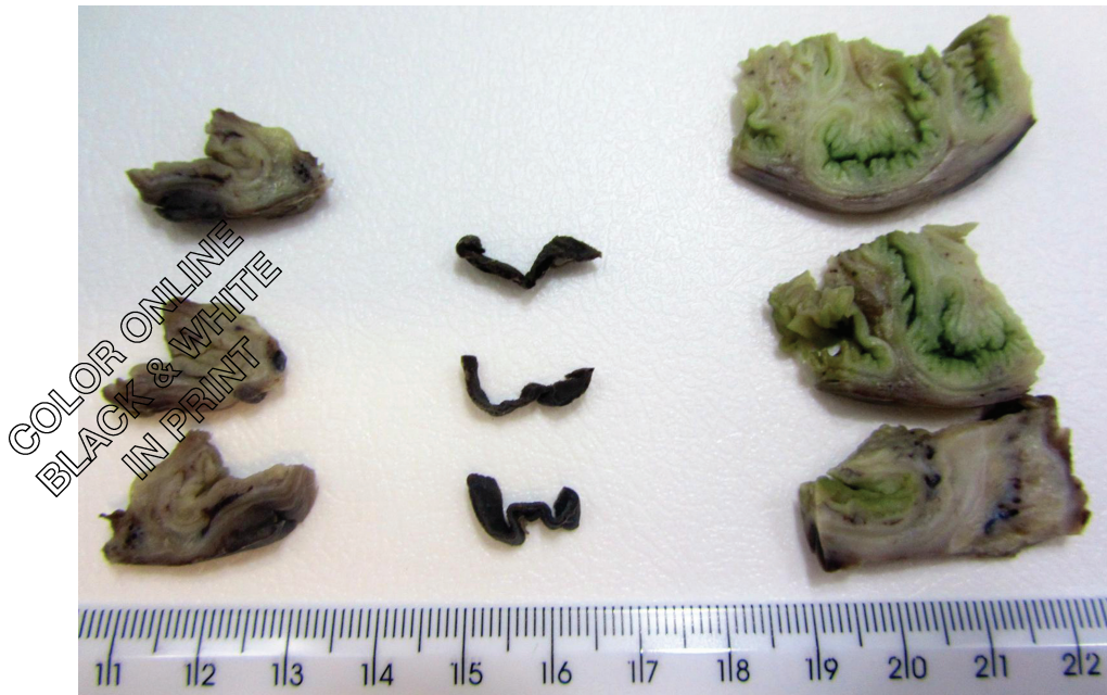
Figure 1. Gross appearance: the cut surface of the proximal 8-cm segment with no gross abnormalities (left); a 20-cm-long stenotic segment showing a reddish appearance on both serosal and mucosal surfaces and prominent thinning of the intestinal wall (center); and a distal 27-cm-long segment of ileal loops with preserved thickness of the intestinal wall but with prominent fibrous adhesences between them (right).