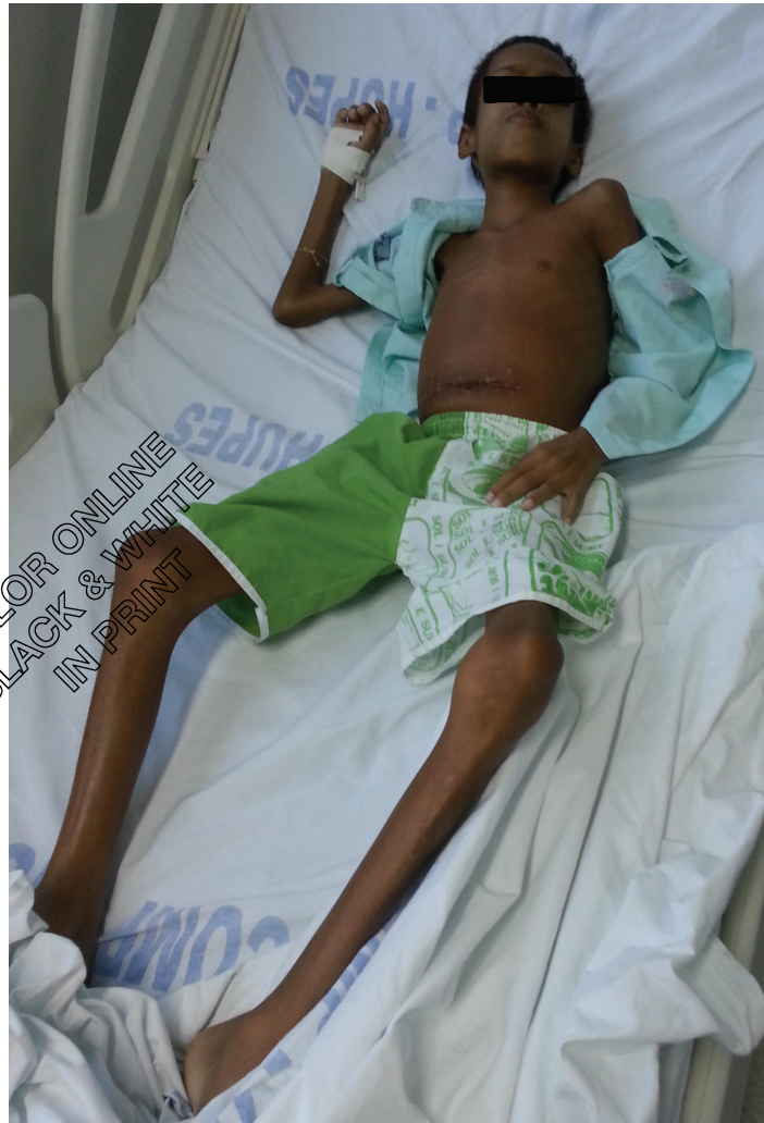
Figure 3. Five months after surgery, the patient shows severe malnutrition.

While well described in neonates, presentation of SAIM in older children and adults is exceptionally rare. To the best of our knowledge, there are three reports of SAIM in adults in the literature. Two reports were of a 34-year-old male and a 64-year-old female presenting as recurrent bowel obstruction and perendoscopic perforation, respectively[6, 7]. The former case is similar to the case reported here with regard to the extent of the SAIM segment (11 cm long in mid-jejunum) and the association with obstructive symptoms[6]. The third report was somewhat different in presentation, with multiple large diverticula in the jejunum as an incidental finding at surgery in a middle-aged male patient[8].