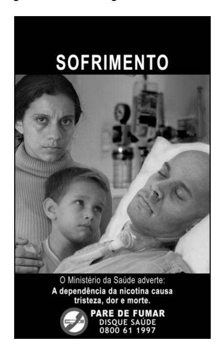
Figure 2 - Suffering