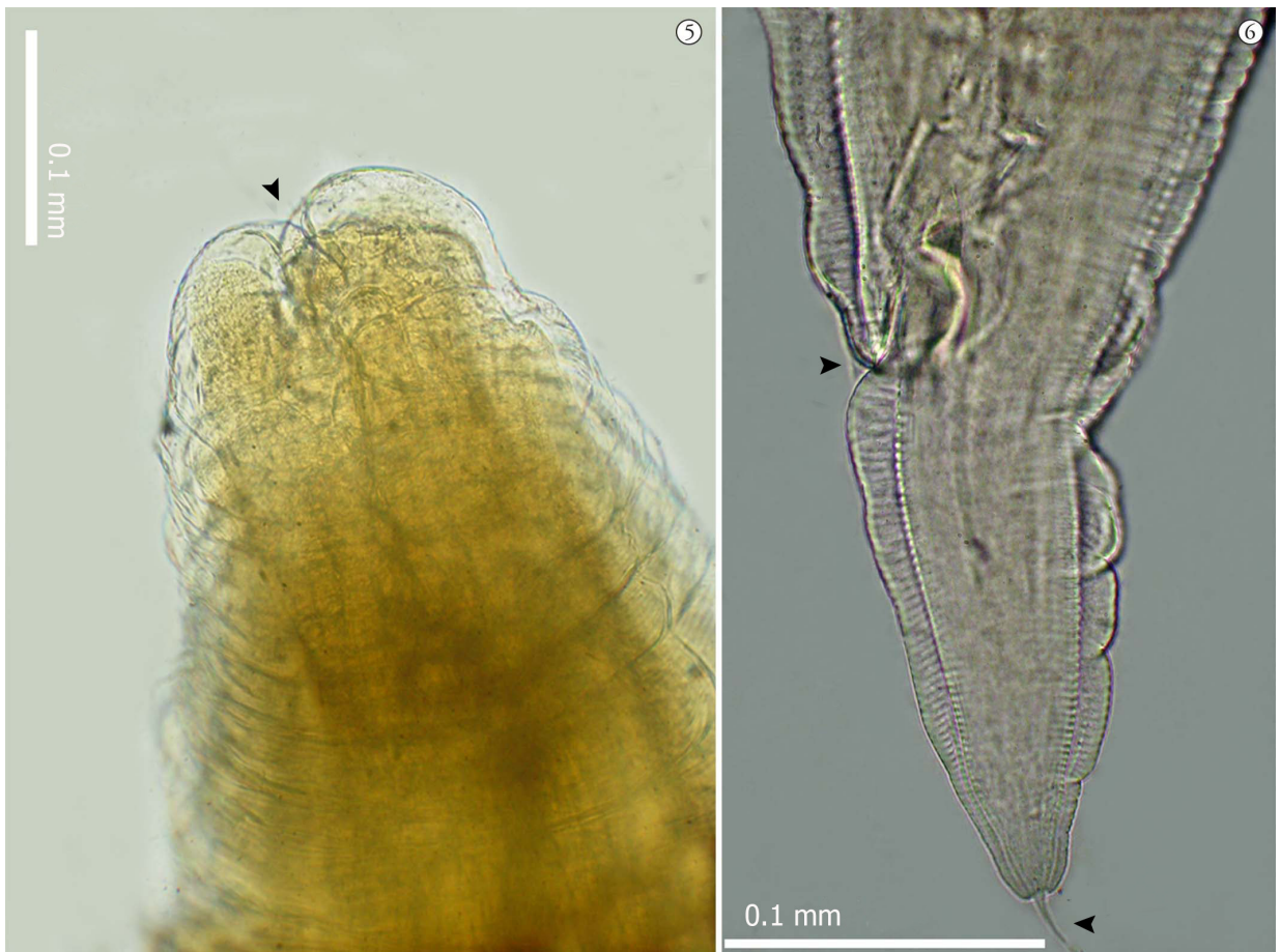
Figures 5–6. (5) Anterior part of the Ascaridia galli female showing three prominent lips. (6) Posterior end of the female showing a subterminal anus (arrow) and a spine at the end of the tail (arrow).