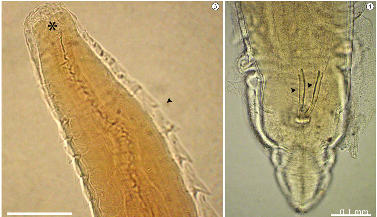
Figures 3–4. (3) Anterior part of male Pterygodermatites (Multipectines) pluripectinata showing that the buccal capsule is dorsally inclined (*) with lateral spines in the body. (4) Posterior end of the male showing two spicules with the same shape and size (arrow).