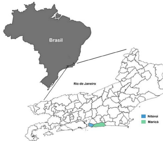
Map of the division of the state of Rio de Janeiro in municipalities (municipalities highlighted represent areas where the work was done).