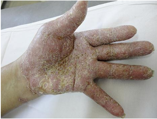
Fig. 1. Pustular palmar lesions, associated with erythema and desquamation.