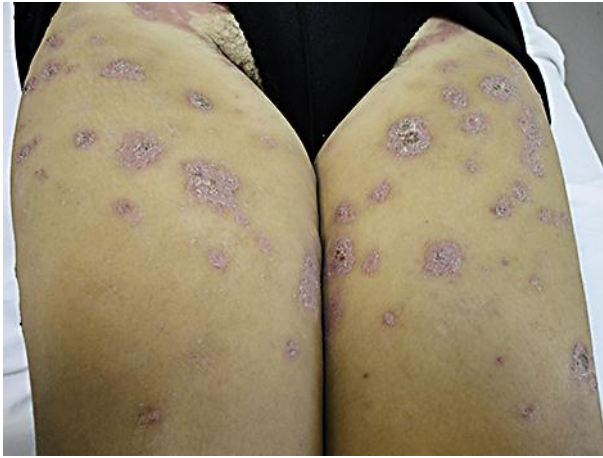
Fig. 3. Pustules in the center of erythematous-desquamative lesions of the lower limbs.