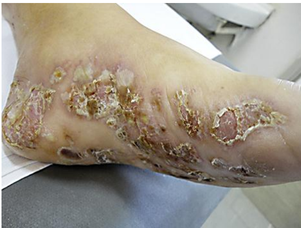
Fig. 2. Pustular lesions on the soles.