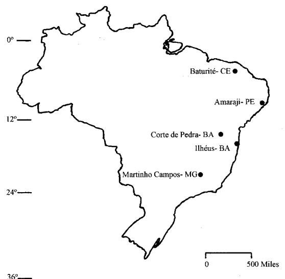
Fig. 1. Distribution of localities used for sand fly captures in Brazil.

Recently, Rangel et al. (1996) observed the existence of 2 geographically isolated forms of L. whitmani